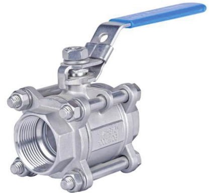
DelVal® Series 64